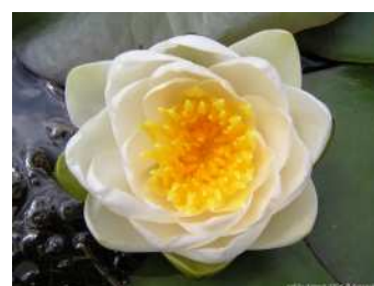
The White Lotus

(6) "Living the Higher Life", Reprinted in "Theosophy" magazine, Vol. I, p. 301. Also Vol. XII, p. 446.