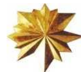
The golden symbol of Sun