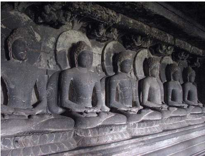
Buddhist statues at Ellora temple

BUDDHIST meditation, scientifically pursued, produces a progressive psychical transmutation, which profoundly modifies character and develops intelligence. The detachment and serenity experienced during hours of meditation, penetrates one's whole life, leads to selflessness and permits one to look upon life impersonally.